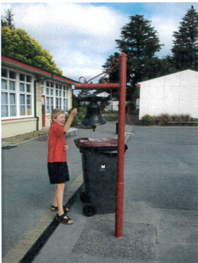
You really enjoyed ringing the bell, you were always on time.