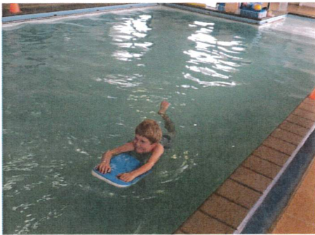
Look how well you can swim now WOW!!!